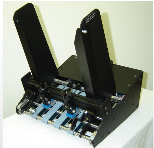
Straight Shooter Model C-12 Patents Pending

Straight Shooter takes friction feeding to a new level with these exclusive features: